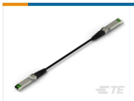
TE Part # 2334985-2 SFP28 DIRECT ATTACH CA, 1M, 32AWG