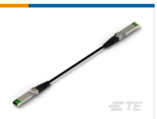
TE Part # 4-2334985-2 SFP56 DIRECT ATTACH CA, 1M, 32AWG