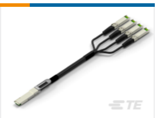
TE Part # CAT-C11-N490333 QSFP28-Four SFP+ Cable Assembly: 30 AWG