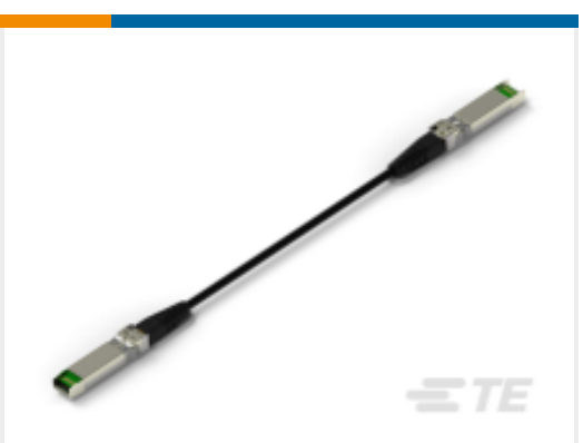
TE Part # 4-2821224-5 SFP56 DIRECT ATTACH CA, 3M, 26AWG