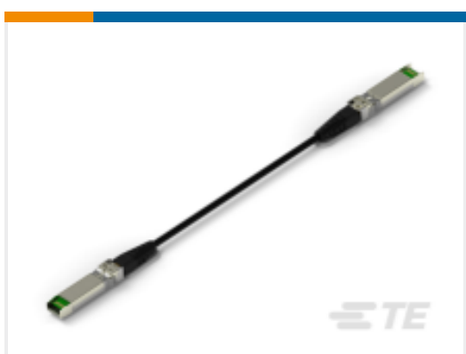
TE Part # 4-2821222-5 SFP56 DIRECT ATTACH CA, 2M, 30AWG