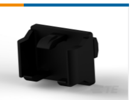
TE Part # 1761394-1 DUST COVER, SFP, GANGED & STACKED