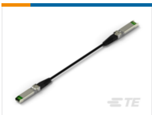
TE Part # CAT-C11-N490114 SFP28 to SFP28 Cable Assembly: 30 AWG