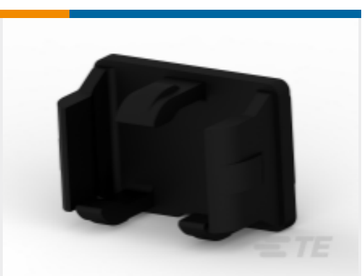
TE Part # 1367147-3 SFP COVER, UNPL, NO LOGO