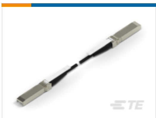
TE Part # CAT-C11-H50626 SFP+ to SFP+ I/O Cable Assembly: 30 AWG