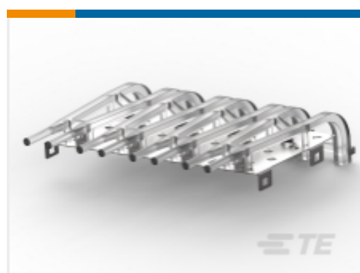
TE Part # 2007099-1 SFP+ 1x4 Light Pipe Assembly