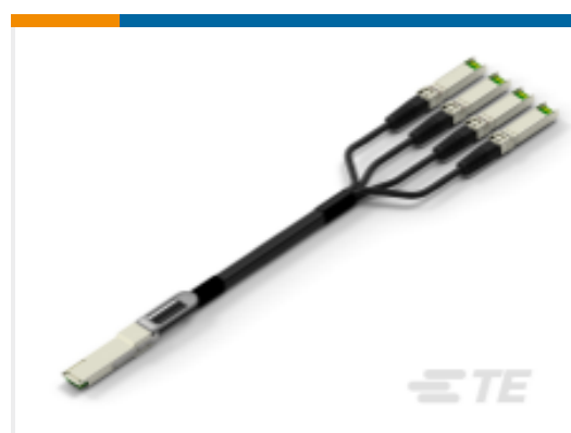
TE Part # CAT-Q17-N490333 QSFP56-Four SFP56 Cable Assembly: 26 AWG