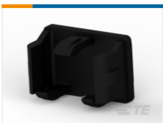
TE Part # 1367147-1 SFP COVER, UNPLATED